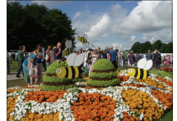
Taste of summer 2010 at the Tatton Park Show